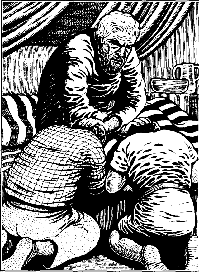
Israel asked God to greatly bless his grandsons, Ephraim and Manasseh.

would become. The forty-ninth chapter of Genesis records the prophetic words God inspired Israel to speak. Read this chapter with your parents and discuss the meaning of the prophetic remarks Israel made about each of his sons.