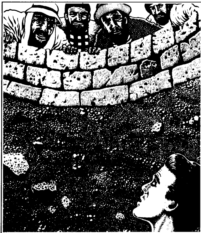
Midianite slave traders agreed to buy Joseph for twenty pieces of silver.

he again unwisely related to his brothers. In this dream he saw the sun, moon and eleven stars bowing before him. When Israel heard about the dream he rebuked Joseph. “Shall your mother and I and your brothers bow down before you?” (Genesis 37:9-11.)