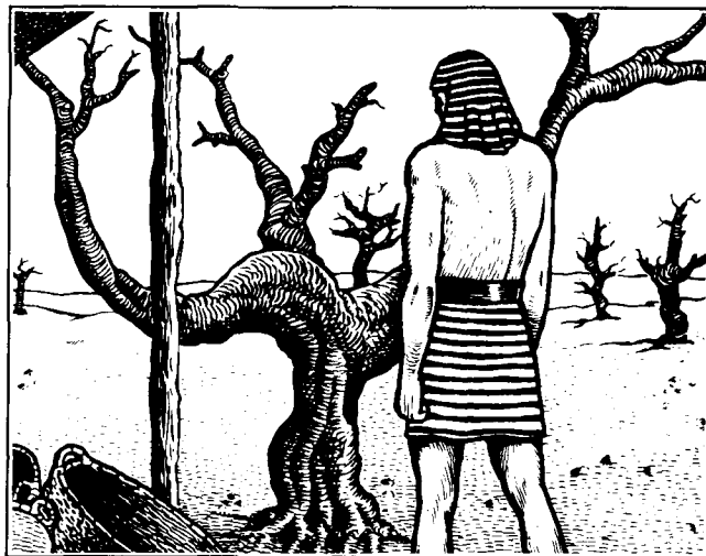
Pharaoh’s dream revealed that Egypt would be stricken with seven years of severe famine.

After carefully considering the matter, and deciding that Joseph’s advice was good, Pharaoh asked his advisors, “Where can we find such a man as this to oversee our farming? What better man could there be but Joseph, in whom the Spirit of God dwells?” They agreed that Joseph should do the job.